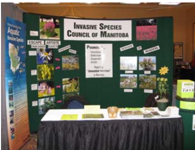
The ISCM had a booth at February's Manitoba GreenShow.

In December, various members of the ISCM executive participated in an invitational Canadian Invasive Plant Framework regional workshop hosted by the Canadian Food Inspection Agency in Winnipeg. The new nation-wide framework will be published in the fall of 2008, and we look forward to working with this new tool.