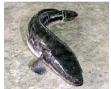
Northern Snakehead fish.

For more information on presentations such as this, contact Haley Catton at hcatton@winnipeg.ca