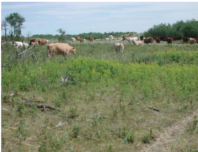
Cattle graze right up to patches of leafy spurge, but avoid grazing the plant itself.