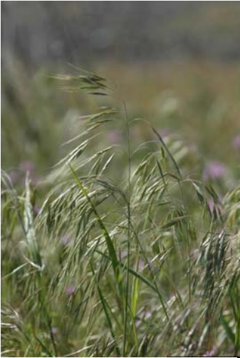
Downy brome, the invasive species highlighted in the Amazing Agriculture Race at Ag Days in Brandon in January 2008.