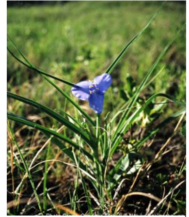
Western spiderwort, a Species At Risk.

"The presence of Species at Risk increase the level of weed management required".