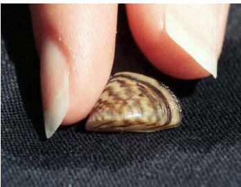
A zebra mussel. A picture is great but the actual item even better. Photo from: http://epistemicgames.org/cgi-bin/coweb/science.net

By Laurie Wesson Fisheries and Oceans Canada